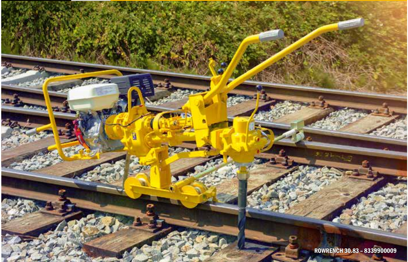
ROWRENCH 30.83 – 833990009

For all drilling and wrenching tasks that arise in track construction. Particularly suitable for dowel repairs.