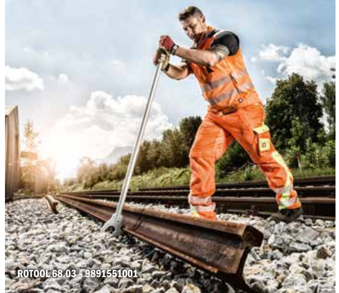
ROTOOL 68.03 - 9891551001