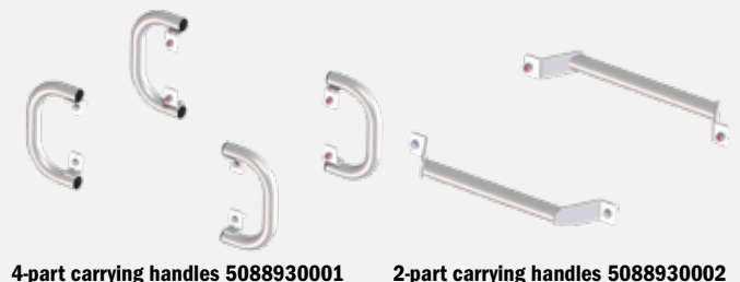
4-part carrying handles 5088930001