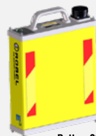
Battery 2300 Wh - 7839900001