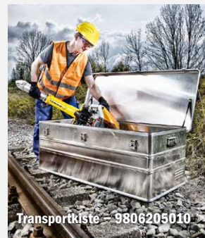
Transportkiste - 9806205010