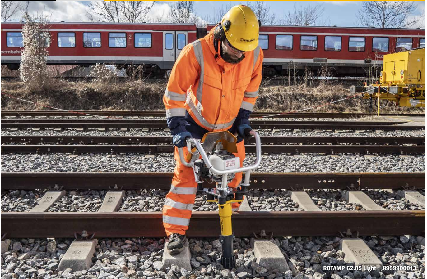
ROTAMP 62.05 Light – 8999900013