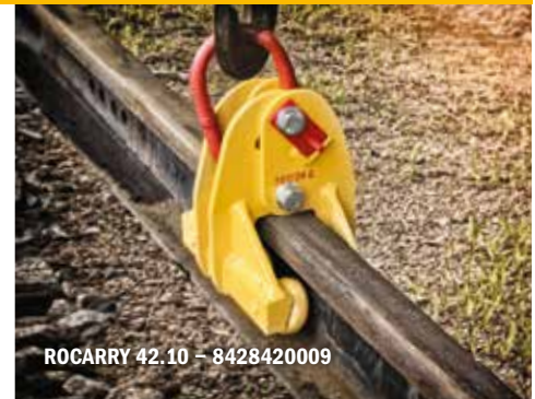
ROCARRY 42.10 – 8428420009