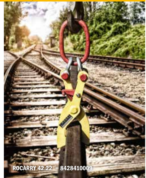
ROCARRY 42.22 – 8428410009