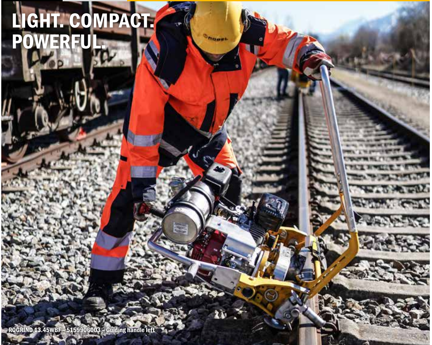
ROGRIND 13.45WBF - 5159906003 - Guiding handle left

For precise grinding of welding joints and for reprofiling the complete rail head. Can also be used in switches and for grinding grooved rails.